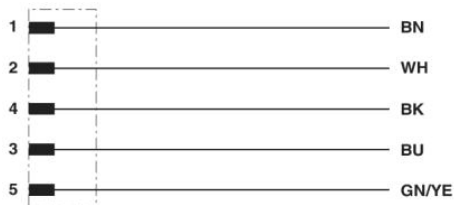
Contact assignment of the M12 plug