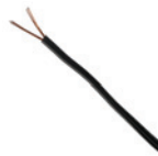
FIGURE 8 SPEAKER CABLE - 100M REEL

Roll of flexible, standard black speaker cable. 2 x (7x0.18mm).